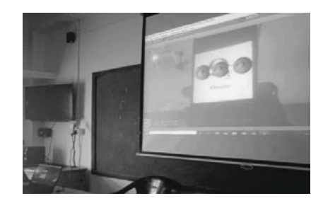
Figure 7 Augmented Reality view of view of Ozone