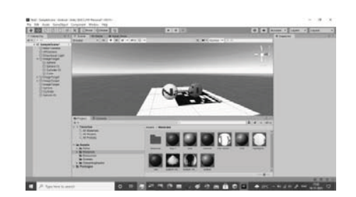
Figure 5 (Augmented reality view of NaCl)